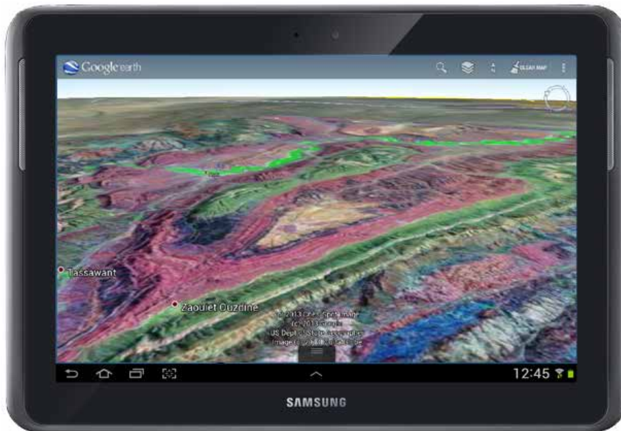
Google Earth Android app displaying the custom Google Earth tileset extracted and converted from MicroImages' global 7-4-2 False Color Google Maps tileset.

When you create a Google Earth tileset subset, you can now also choose to package the entire tileset in a single compressed KMZ file. This option simplifies moving the tileset and transferring it to the tablet via data cable, SD/MicroSD card, cloud storage, or e-mail. This option works best for small tilesets (100 MB or less for tablet use). The decompression required when reading tiles from a large tileset packaged as a KMZ file can increase tile load times and reduce performance in the Google Earth Android app. See the TechGuide entitled Tilesets: Create Google Earth Tilesets as KMZ for more information.