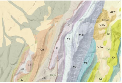
Rock unit polygons and label text