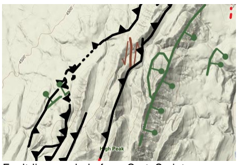
Fault line symbols from CartoScript