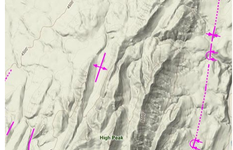
Fold line symbols from CartoScript