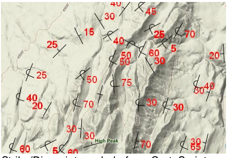
Strike/Dip point symbols from CartoScript

SVG Geometric Tileset Layers in Geologic Map Geomashup (over Google Terrain)