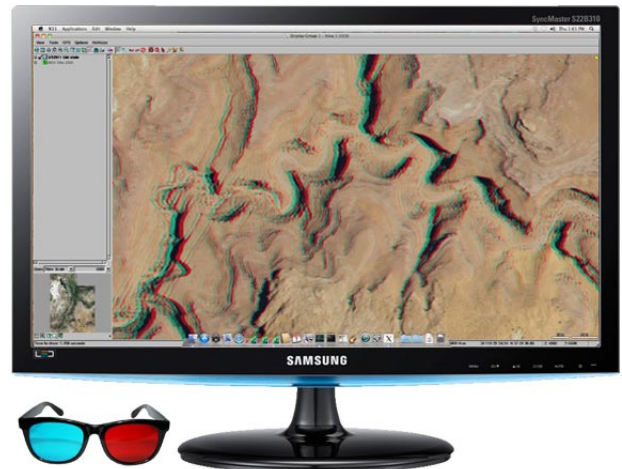
Anaglyph 3D: use any plastic anaglyph glasses and any available color monitor, TV, or projector.