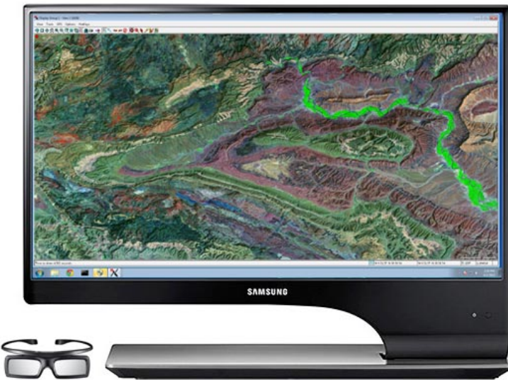
Active 3D: choose a laptop, monitor, TV, or projector that uses shuttered glasses. Samsung 27" 3D monitor shown.