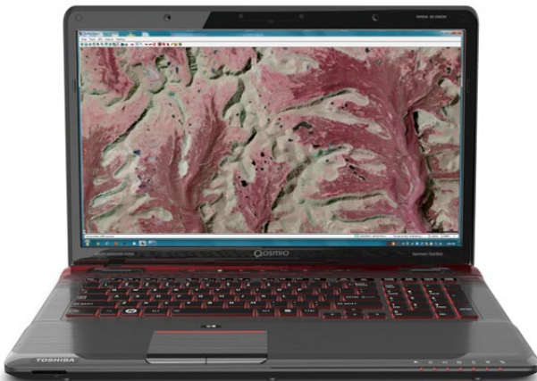
Glasses-free 3D: this powerful and unique Toshiba 15.6" laptop uses autostereoscopic 3D, eliminating the need for special glasses.