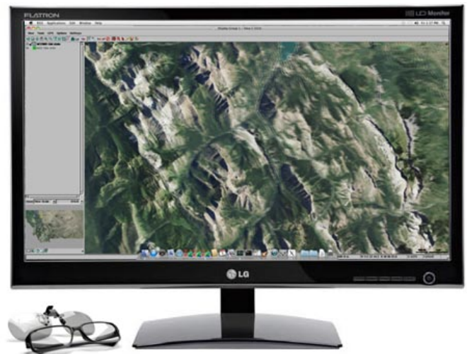
Passive 3D: add a monitor, TV, or projector to any computer and use polarized glasses. LG 23" 3D monitor shown.