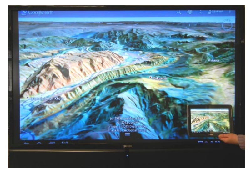
You can sync a WiFi-enabled tablet with a large-format television so that the tablet image (such as your Google Earth session) can be shared with a room full of people viewing the television.

Google Earth tilesets that you create in TNTmips allow you to view your own custom imagery in real-time perspective 3D in Google Earth. These tilesets can also be transferred to Android tablets for mobile viewing in the Google Earth app, as shown above. A smaller tileset can be packaged as a single