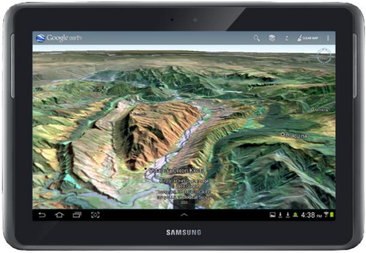
Google Earth Android app showing a custom tileset created in TNTmips from three bands of an ASTER satellite image of an area in Bolivia (middle infrared, near infrared, and green bands as red, green, and blue, respectively).

Google Earth tilesets that you create in TNTmips allow you to view your own custom imagery in real-time perspective 3D in Google Earth. These tilesets can also be transferred to Android tablets for mobile viewing in the Google Earth app, as shown above. A smaller tileset can be packaged as a single