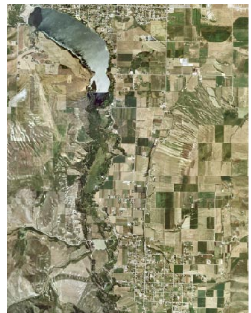
Left, a natural-color 1-meter orthoimage color-composite of an area in Utah, USA. Right, color-composite image produced by the Apply Contrast process using Exponential contrast tables for the Red and Green color components and a Linear contrast table for the Blue component.