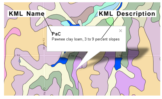
Google Maps info window for a soil map polygon in a KML geometric tileset showing the soil symbol as the KML name at the top followed by the full soil name as the KML description.

In TNTmips you can set up DataTips for your geospatial objects to dynamically show attribute information in TNT view windows. When the mouse pauses over any spatial element (such as a point, line, or polygon), a pop-in DataTip shows the attribute information for that element using the database field you have designated as the DataTip source. Google Maps, Google Earth, and the Google Earth browser plug-in employ a somewhat similar concept to present descriptive information for the map features in KML overlays in these geobrowsers. An Info Window (also called the information window, info balloon, or description balloon by Google) is displayed over the map when the user left-clicks on a map feature. The info window shows particular information stored with the feature in the KML file: the name of the feature at the top of the window, followed by the description below it (see illustration to the right).