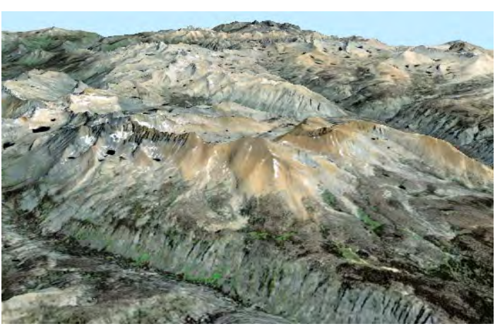
3D Perspective view of mountainous terrain in the Sierra Nevada, California; pan-sharpened Landsat 7 scene (15-meter cell size) draped on terrain extract from the NED30 dataset.