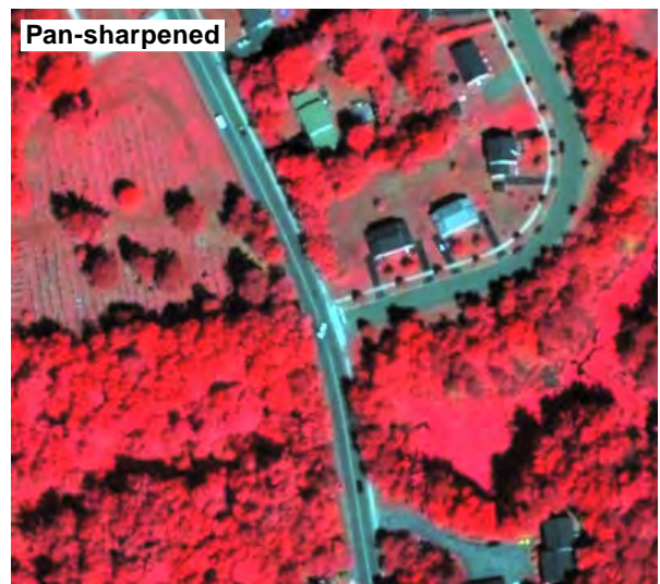
Summary of Multiresolution Fusion Inputs, Products, and Methods