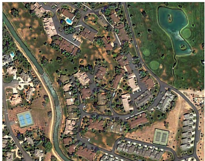
Pan-sharpened natural-color composite produced in the Multiresolution Fusion process from this QuickBird scene using the sensor-tailored calibration. The result using the Paris color fusion method is a 0.7-m color image with proper color balance.