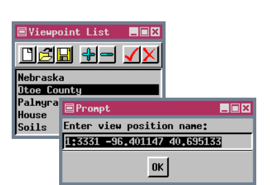
The ViewMarks Tool Script builds up a list of desired view points and scales so you can jump to specific locations.

A number of different sample Tool Scripts are provided with the TNT products. You can use components from any or all of these scripts to create the custom tool you need for your specialized application. The interface windows created by some of these Tool Scripts are shown below.