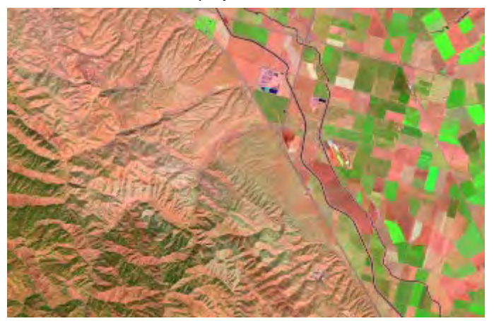
Scaled-reflectance bands produced by the SRFI script retain terrain-induced brightness effects in the hilly area in the southwest half of image.