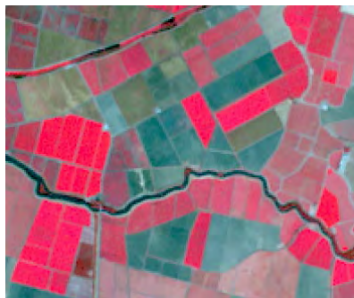
Color-infrared combination of Landsat 7 bands (corrected to calibrated surface reflectance using the SRFI script) for an agricultural area near Stockton, California. Bright red colors indicate fields with the highest green vegetation biomass; fields with bare soil are blue-green.

Multispectral satellite images of agricultural and range land can be used to map biophysical properties such as the surface color and moisture content of exposed and subcanopy soil, green and brown vegetation biomass, and others. Other applications include removal of the effects of unresolved intermittent grass and shrub cover to enhance the spectral mapping of exposed geological surfaces. The Tasseled Cap transformation simultaneously computes 2 or more biophysical indicators from a set of 3 or more multispectral image bands. It can therefore incorporate more information than ratio or modified ratio indices (like most vegetation indices), which use only a pair of spectral bands.