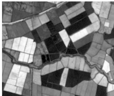
Tasseled Cap Component 2 (Greenness) for the same area computed from six bands of the SRFI-scaled Landsat 7 image. Bright tones indicate fields with the highest green vegetation biomass; fields with bare soil are dark.