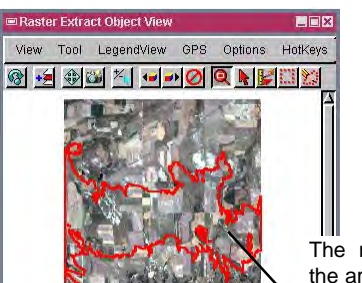
The null cells are transparent.