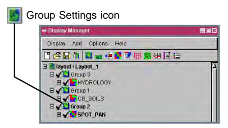
Group 2 and Group 3 are geographically attached to Group 1.