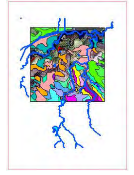
Group 2 is clipped using the extents of Group 1, while Group 3 is not clipped.