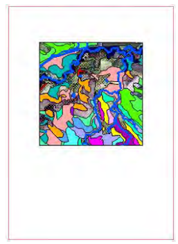
Both Group 2 and Group 3 are clipped using the extents of Group 1.